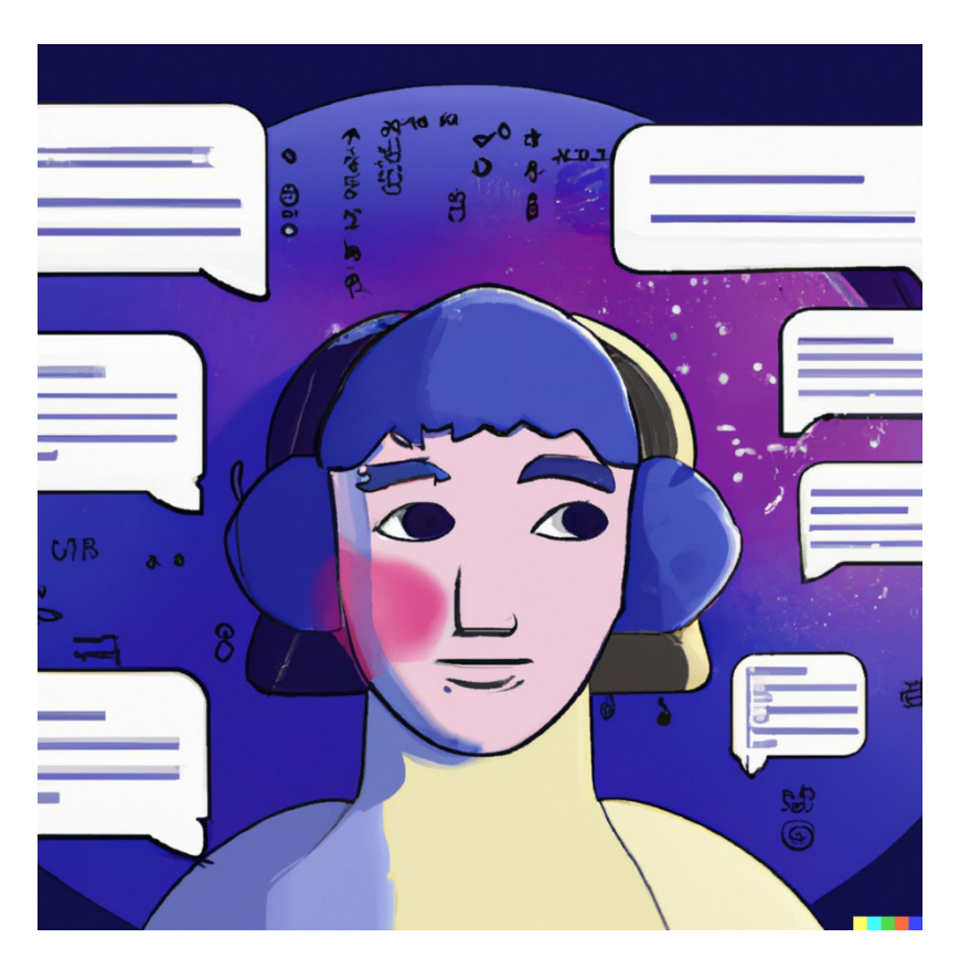
Conceptualize person engaged in multiple chat sessions created with Generative AI (DALL-E 2)

To mitigate these limitations and ensure the successful implementation of GANs, businesses should take the following steps: