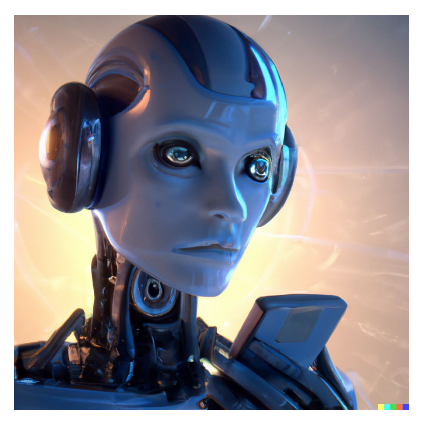
Conceptualize AI Chatbot created with Generative AI (DALL-E 2)

However, it is important for businesses to approach the use of GANs with caution. While GANs are a powerful tool for image generation, they can also generate biased or inappropriate images if they are not properly trained. Additionally, GANs can sometimes generate images that are too similar to the training data, leading to overfitting and decreased generalization – both common challenges within machine learning.